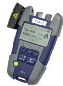
Optical Light Source